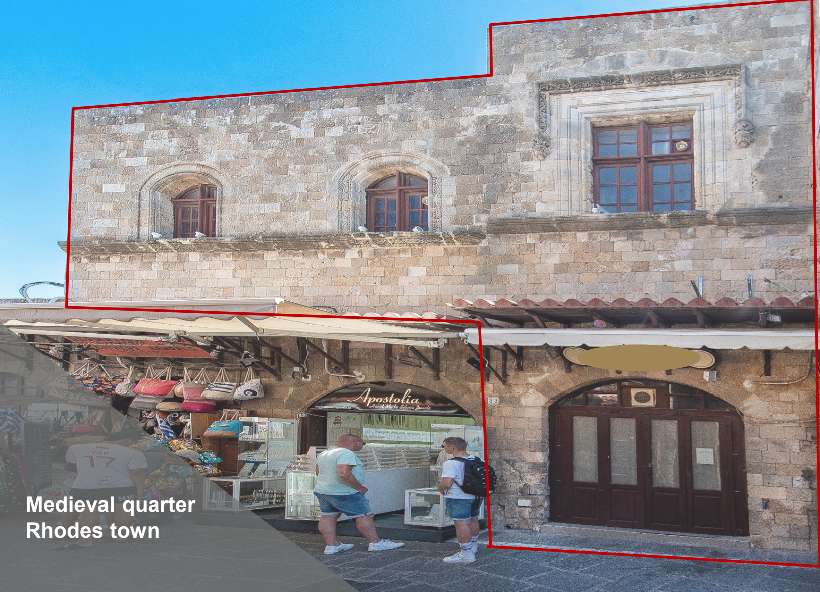
Medieval quarter Rhodes town